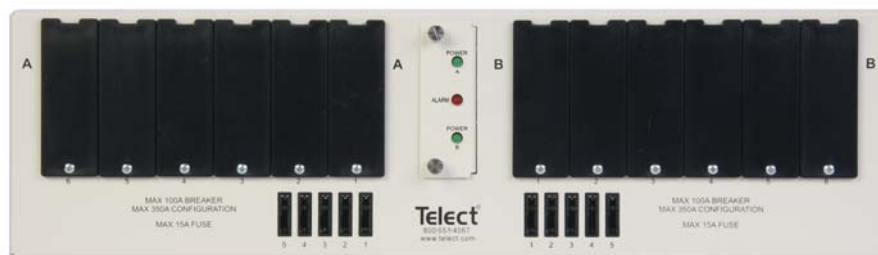
350CB06 Front View

Note: Panel ships without circuit breakers or fuses. Circuit breakers, or TFD holders and fuses must be ordered separately. See page 2 for ordering information. TFD fuse holder is CSI TFD-011 with internal schematic “C”, and supports TPS and TLS fuses. The panel also supports GMT fuses.