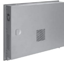
▲ Less screw design