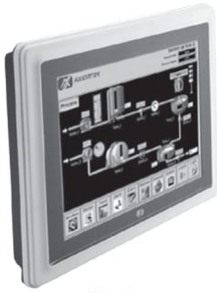
▲ Side view