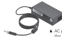
▲ AC power adapter (for GOT5120T-834-XGA-J)