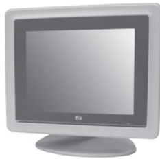
▲ Desktop stand