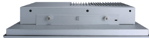
▲ Top view