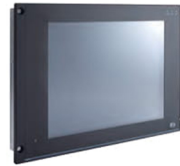
▲ Touch without keypad version