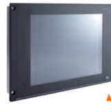
▲ Touch without keypad version